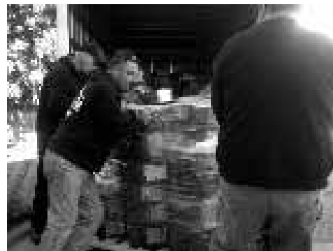
Eighteen pallet loads arriving for cold storage.

People want a connection to their past, and because of the work we do throughout New England that connection is available in a personal way. And while the MBRS hosts a variety of events it is hard to imagine that they can accomplish the same personal touch in the diversity