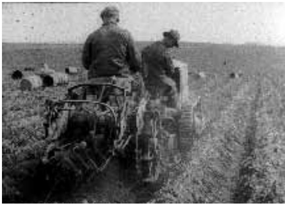
The How and Why of Spuds, 1920.

Images and archetypes of the city and the country as seemingly distinct locations and ways of life have remained a potent force in the cultural imagination since the mid-19th century. Even though the transformations of industrial culture and mobility have changed rural and urban landscapes and lifestyles, the ideas and images associated with the City and the Country continue to thrive as traditional poles of modern experience. They are