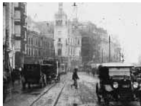
From the NEH Digital Start-up Project, Shanghai, 1928, Frame enlargement from 16mm film.

In June the Maine Humanities Council voted $5,000 for Moving Image Review Online . The funds result from a 2006 state bond issue; our project qualifies as "long-term infrastructure." We are creating a Web-based tool making use of 20 years of Moving Image Review . The Maine Memory Network at Maine Historical Society is participating, working with stories from our collections and contextual materials to create new electronic exhibits. Windows on Maine