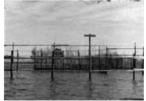
A fish weir.

The groundfishermen aren't the only ones complaining about the herring trawlers. In May 2007, 12 organizations came together to form the Herring Alliance. The Alliance, which includes such organizations as the Pew Charitable Trust, National Resources Defense Council, and the Conservation Law Foundation, hopes to reform the Atlantic herring fishery to protect and restore marine ecosystems in the northeastern United States. Herring are at the base of the food web. In other words, the little fish are essential for bigger fish (including tuna, cod, and haddock), marine mammals like seals and whales, and seabirds. Herring also serve a vital role in Maine's most lucrative fishery—as lobster bait. The mission of the Herring Alliance is to manage the herring fishery with respect to the marine ecosystem, preserving