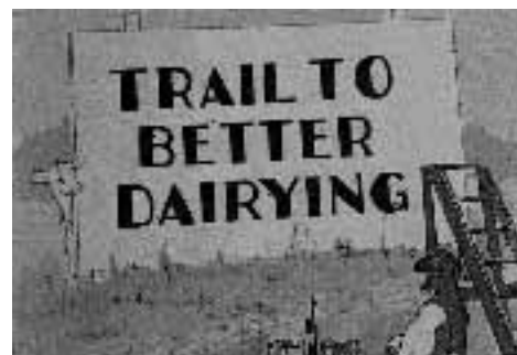
Trail to Better Dairying , 1946, Hancock County Extension Collection, 16mm frame enlargement.