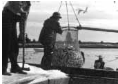
A fisherman guides a net full of herring from the seine to the platform where a man prepares to cover the fish with salt. Images are frame enlargements from the Ernest G. Stillman Collection.

A second film shows fishermen using a weir to catch juvenile herring, “future sardines,” as the intertitle explains. Like the seine, the weir corrals the fish in the net and prevents their escape. The fishermen scoop the trapped fish out of the water and empty their nets onto a platform. Here, a man tosses shovelfuls of salt over the wiggling fish. Stillman shows us the process of getting the fish into the canneries and then cuts to the final product: a can of Billow Brand American Sardines.