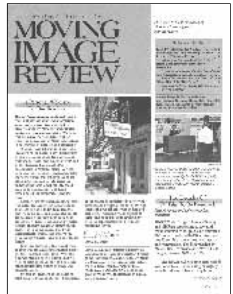
Our first cover, Winter 1988.