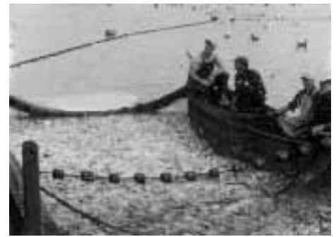
Fishermen relaxing in a whaleboat with the seine strung between their boat and the platform. Whaleboats were designed for whaling, with pointed ends to facilitate speed and quick turns. The term later came to describe any long rowboat pointed at both ends.