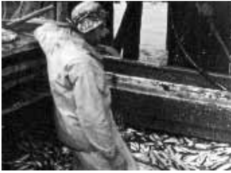
A fisherman stands thigh-deep in herring.

So groundfishermen are upset with the herring fishermen. In October, New England fishermen filed a petition to ban herring trawlers from groundfish hotspots. Current fisheries management allows herring trawlers to fish in areas that are closed to groundfishing. As Craig Pendleton, director of Northwest Atlantic Marine Alliance, says, "These areas are the last places you want midwater trawls. If our fishing industry is going to survive, we need to stop overfishing and protect spawning grounds, not leave them open to giant midwater trawlers that wipe out everything in their path."