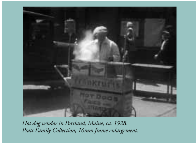
Hot dog vendor in Portland, Maine, ca. 1928. Pratt Family Collection, 16mm frame enlargement.