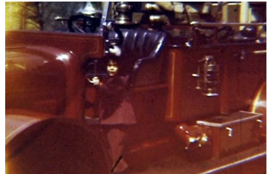
"o little jeannie" (date unknown) Collection of Jeanne Liotta

Provocatively mixing media and methods in a manner akin to that of the wonder cabinet itself, my presentation explores this adoptive autobiographical gesture as it has informed the work of three American women—an experimental filmmaker, a photographer, and a film historian/art collector—each of whom has invested home movies, vernacular photographs and/or found objects with personal significance. At once drawn to and disturbed by what these artifacts reveal and conceal about the social construction of femininity, each has preserved her salvaged treasures in a private collection, where they serve as mirrors, talismans, reminders, and warnings. This presentation creates a composite portrait of the practice of female collecting by juxtaposing three different ways contemporary women have adopted and reimagined the visions of femininity embodied in anonymous home movies and discarded objects. If for each woman the allure of what she has salvaged is tinged with ambivalence, perhaps it is because when it comes to identity, every contradiction is illuminating, precious, and therefore to be treasured.