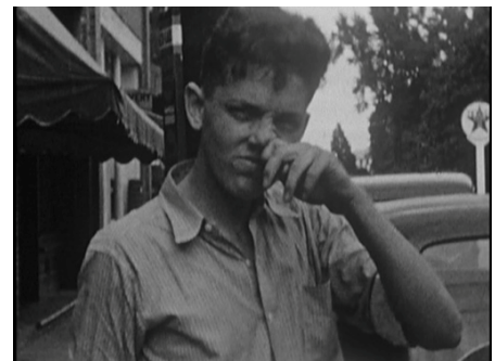
Gas station attendant, 1936.

In 2009, the University of Georgia Libraries' Media Archives was given 38 home movies [1930s-1960s] showing one Georgia family's life events, scenes of children at school, a tour around the small town where the family lived, as well as cartoons and a burlesque reel—a pretty typical 8mm collection. But one reel stood out for its visual representation of racism, something we had never seen in a home movie. How we have dealt with and also not dealt with this film, and the implications for donor relations, perceptions of our mission, and the broader aspect of how this film could be used in teaching will be discussed. This is the debut screening of this film since its acquisition and preservation.