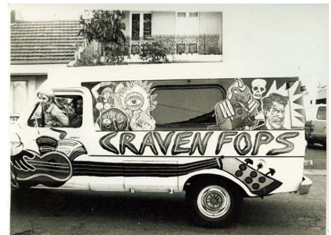
Stockwell, Sydney, 1986

Brisbane in the early 1980s was a metropolis governed by a State leader galvanized against modernity, which he saw as a source of moral decay. For the city's youth interested in creativity and cultural engagement, the choices were few. Nevertheless a lively amateur scene emerged of music making (The Saints and The Go Betweens later came to international acclaim) of theatre, the visual arts and filmmaking. This paper will examine some of the fragments of footage from that time including Hits, Brainblast, City for Sale, Love Strangled Cry, and Expo Schmexpo, and how they informed and animated the extra-parliamentary opposition to an aggressively conservative government, and provided the outlet for youthful exuberance and creative pursuits.