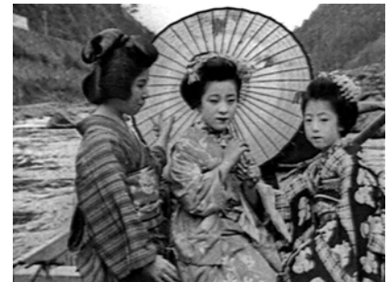
Japan: Promotional and Theatrical Footage, ca. 1927], Human Studies Film Archives, Smithsonian Institution

Found in an American Methodist minister's personal around-the-world travel film collection, this 17 minute compilation film of Japanese themed film segments begs many questions. Physical examination of the film offers some information, but what might it take to understand why this film ever existed? This compilation engages us in the mystery of the amateur filmmaker's curiosity and the desire to record it.