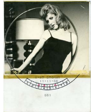
Starlight Peep Show Marquee Card

While we tend to associate movies with their theatrical presentation, films have been shown in single-viewer machines throughout their history (from the earliest hand-cranked Mutoscopes to the contemporary handheld device). This paper will address the evolution and phenomenology of the single-viewer apparatus, with a particular focus on the pornographic motion picture peep show machine. My presentation will be divided between two related aspects of peep show culture: framing the peepshow apparatus as a literal cabinet of curiosity, and examining the curious content of the film loops themselves. Both the technology and the filmic texts vary widely based on time period and regional zoning and censorship regulations, making this project extremely challenging, historically and archivally. This presentation will provide an overview of the evolutionary transformation of peep shows, and to initiate a discussion regarding the place of the pornographic peeping apparatus within amateur and non-theatrical film history.