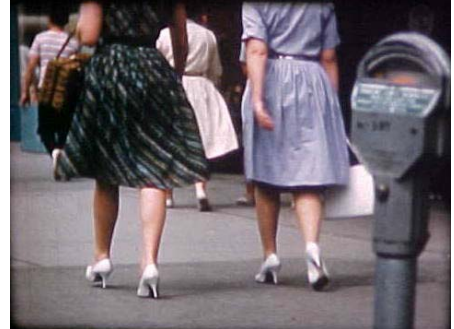
Image from [Syracuse Voyeur] - Orphaned Home Movie, ca.1962